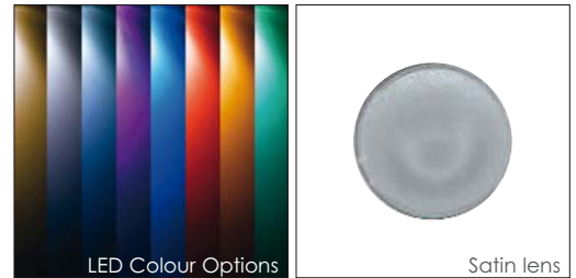
LED Colour Options