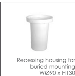
Recessing housing for buried mounting WØ90 x H130