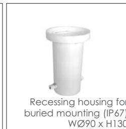
Recessing housing for buried mounting (IP67) WØ90 x H130