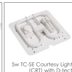
5w TC-SE Courtesy Light (CRT) with D-tect