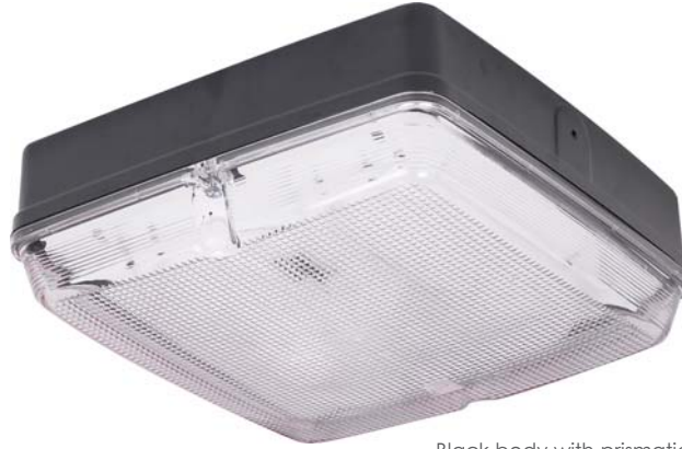
Black body with prismatic lens

Hawk, IP65 low energy compact fluorescent wall/ceiling luminaire; vandal resistant for interior or exterior use. Ideal applications include toilets, corridors, stairways & passageways etc.