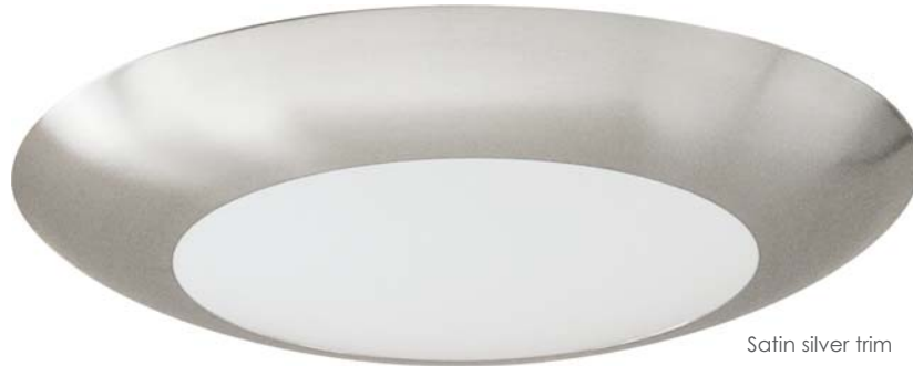
Satin silver trim

Orbit Halo, contemporary low energy compact fluorescent wall/ceiling luminaire. Features slim body profile and domed opal polycarbonate lens with decorative trim. Ideal for low ceilings, including staircases, corridors, lounges, porches, balconies etc.