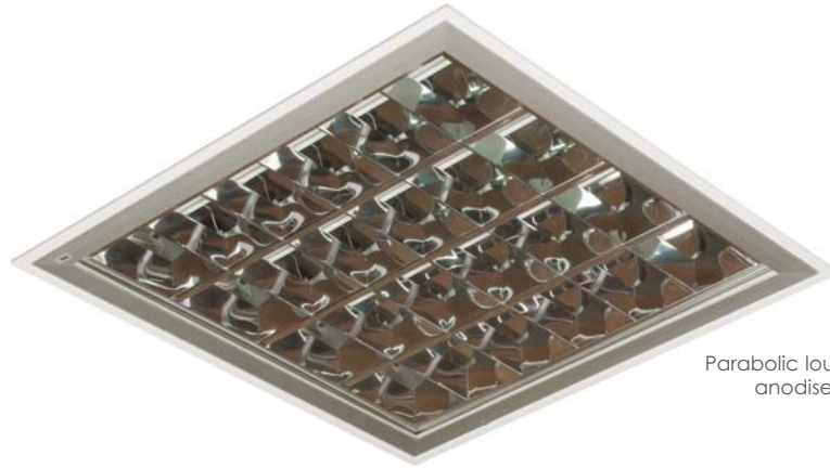
Parabolic louvre with anodised frame

Bia TC-L, recessed IP54 or IP65 high frequency compact fluorescent modular luminaire, designed for narrow/wide (15/25mm) 'T' grid systems and plasterboard ceilings. Features smooth rigid aluminum frame with single lever opening system for easy installation/maintenance. Ideal for clean rooms, pharmaceutical, healthcare, laboratories, food preparation areas etc.